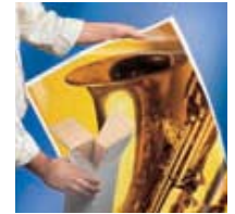
Flexible Indoor Displays